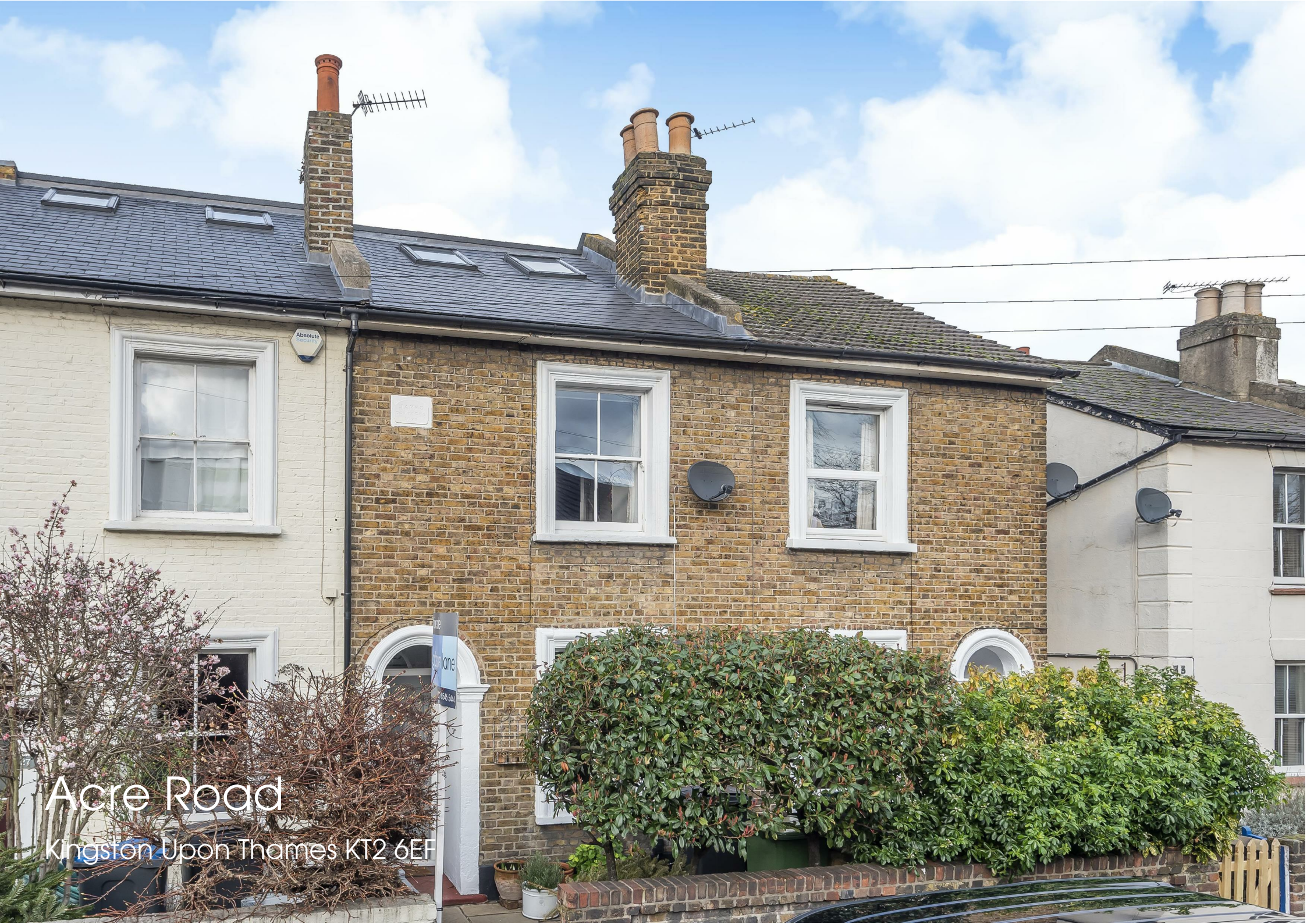
Acre Road Kingston Upon Thames KT2 6EF